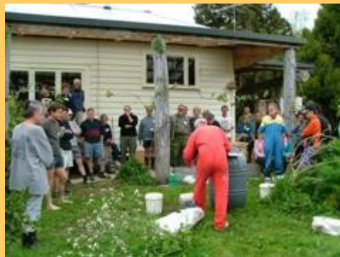
(A teaching experience from the 2004 Conference)